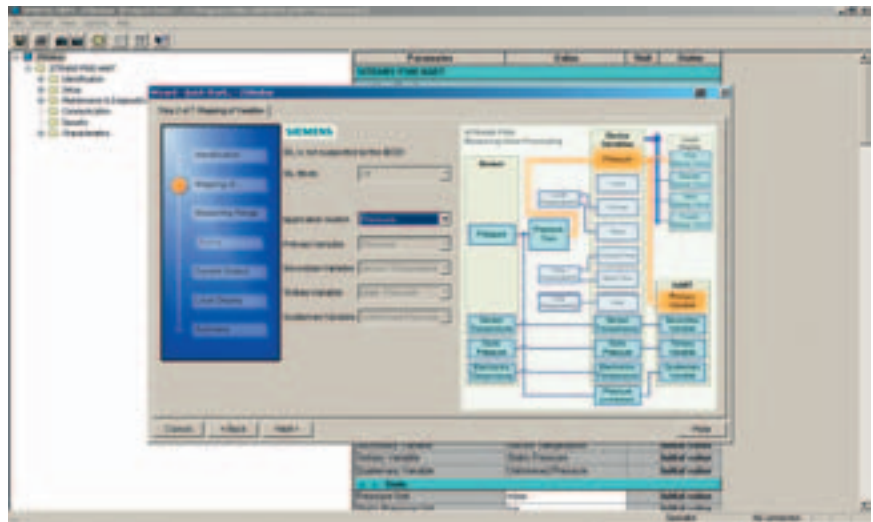
User-friendly HART start-up thanks to SIMATIC PDM rapid Quickstart Wizard